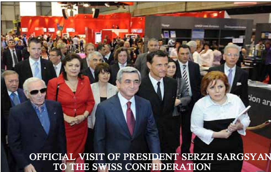
OFFICIAL VISIT OF PRESIDENT SERZH SARGSYAN TO THE SWISS CONFEDERATION

At the invitation of the President of the Swiss Confederation Micheline Calmy-Rey, President Serzh Sargsyan arrived today to Geneva on a working visit. In the framework of the visit, the President of Armenia visited the 25th International Book and Press Fair. After touring the Fair, President Sargsyan spoke about his impressions, noting that the Fair is a significant event on the eve of the 500th anniversary of Armenian book printing and celebrations in Yerevan which has been declared the 2012 Book Capital of the World. Serzh Sargsyan noted with satisfaction that at the 25th Geneva Fair Armenia is honorary guest. "We have the deepest reverence for books which goes back centuries and comes from the times when the first Armenian book had been written in the newly created Armenian alphabet – it was the translation of the Bible. Almost simultaneously created were the masterpieces of the Armenian literature, which in many ways are perfect didactical materials even today. In general, that feat of the 5th century, accomplished by our great forefathers, had become the