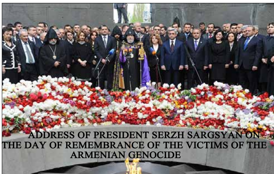
ADDRESS OF PRESIDENT SERZH SARGSYAN ON THE DAY OF REMEMBRANCE OF THE VICTIMS OF THE ARMENIAN GENOCIDE

F ellow Compatriots, Today is the 24th of April, and we commemorate the memory of the victims of the Armenian Genocide. In 1915-1923 a crime against the Armenian nation, against humanity and civilization was committed, which at the time had no name. All the names and definitions – moral, legal, or political – given later are only provisional and only in part reflect what had really happened. The true scope and depth of the tragedy is known only to us, and every Armenian, in any corner of the world, feels devastating repercussions of the Mets Eghern on his or her destiny in every sense – moral, cultural, linguistic and political. The Ottoman Empire implemented at the state level the program of elimination and expulsion of the Armenian people. Throughout the process, at its every stage the murders, deportations, conversions and enslavement of the Armenians were viewed as routine trifles. As for foreign interventions, they failed to stop the perpetrators and in some instances pushed them towards even more gruesome acts.