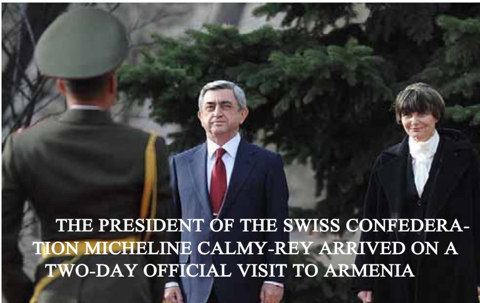
THE PRESIDENT OF THE SWISS CONFEDERATION MICHELINE CALMY-REY ARRIVED ON A TWO-DAY OFFICIAL VISIT TO ARMENIA

A t the invitation of President Serzh Sargsyan, the President of the Swiss Confederation Micheline Calmy-Rey arrived last night on a two-day official visit to Armenia. Today, at the Presidential Palace there took place the official welcoming ceremony which was followed by the tete-a-tete meeting of Presidents Serzh Sargsyan and Micheline Calmy-Rey and the meeting of the delegations in the extended format. Noting, that he has had numerous occasions to meet and discuss issues of mutual interest with the President of Switzerland, President Serzh Sargsyan underlined that yet this is the first visit of the Swiss President to Armenia which provides an excellent opportunity to thoroughly discuss all issues pertinent to the development of the Armenian-Swiss relations. "We hail the decision of the Swiss authorities to open embassy in Armenia. We believe it manifests the intent of Switzerland to deepen our bilateral relations, and we are pleased by the fact. Switzerland achieved impressive results in every area and it's a great honor for us to be friends with the one