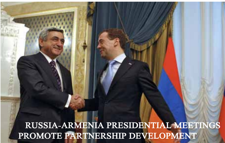
RUSSIA-ARMENIA PRESIDENTIAL MEETINGS PROMOTE PARTNERSHIP DEVELOPMENT

On February 25, St. Petersburg hosted a meeting of Russian and Armenian Presidents Dmitry Medvedev and Serzh Sargsyan. The leaders of the two countries refused to make a statement before the start of negotiations. "It's actions, not words, that matter," Medvedev said. The meeting continued behind closed doors, probably, focusing on bilateral relations and current international issues, Russian media reports. Armenian and Russian Presidents mixed their places during a ceremonial photo session in Saint Petersburg. Journalists noted that Serzh Sargsyan stood at the Russian flag, while Dmitry Medvedev was at the Armenian one. Replying to journalists' remarks, Medvedev said jokingly that this is the "evidence of strategic relations" between the two countries. During a meeting in Saint Petersburg, Armenian President Serzh Sargsyan and his Russian counterpart Dmitry