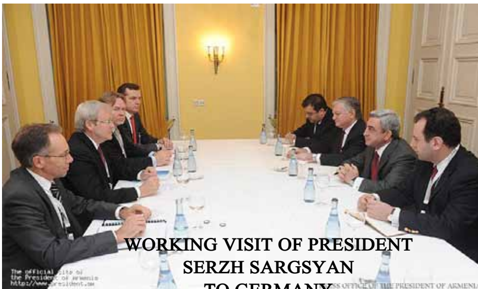
WORKING VISIT OF PRESIDENT SERZH SARGSYAN TO GERMANY

On February 4, the delegation headed by President Serzh Sargsyan arrived to the Federal Republic of Germany on a working visit to participate at the Security Policy Conference which commenced in Munich. The Conference brought together leaders of states and governments from a dozen states and many international organizations, heads of foreign affairs and defense agencies, other high ranking officials. The agenda of the Munich Conference contains a number of important issues which relate to the challenges of global policies. Discussions will be held in the framework of the official segment of the Conference and also during numerous informal meetings of the participants. Today, among other topics the participants of the Conference will discuss issues pertinent to the impact of the financial crisis on the global stability and security. President Serzh Sargsyan, who