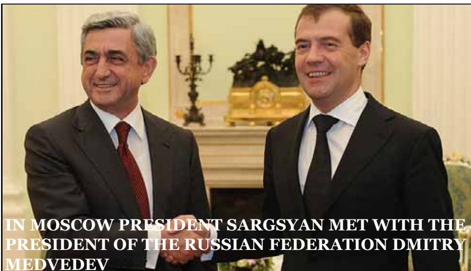
IN MOSCOW PRESIDENT SARGSYAN MET WITH THE PRESIDENT OF THE RUSSIAN FEDERATION DMITRY MEDVEDEV

President Serzh Sargsyan, who is in Moscow on a working visit, met on November 17 with the President of the Russian Federation Dmitry Medvedev. The President of Armenia stressed the importance of regular meetings, which according to him, present a good opportunity to discuss in time and coordinate key issues of the multi-faceted Armenian-Russian cooperation. "I note with satisfaction that our strategic partnership is developing vigorously, and political consultations continue at all levels. Agreements, signed during Your state visit, gave a new impetus to our relations. We agreed to meet in the late fall and recap the process of implementation of the reached agreements," President Sargsyan said, underscoring also that Armenia strives for peace and security in the Caucasus, and it makes for our country's efforts to find a lasting solution to the NK issue. President Sargsyan said that Russia has always played a positive role in the Caucasus and expressed gratitude to Dmitry Medvedev for his efforts. He expressed hope that these efforts would soon bring positive results.