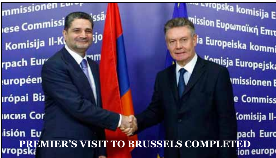
PREMIER'S VISIT TO BRUSSELS COMPLETED

On November 13, Prime Minister Tigran Sargsyan-led delegation wrapped up their one-day working visit to Brussels. First, the Prime Minister had a private meeting with deputy chairman of the European People's Party, member of the European Parliament Khayim Mayor Oreja. The Prime Minister's next meeting was in the EU Commission where Tigran Sargsyan met with EU high commissioner for trade Karel De Gucht to discuss the current status and the outlook of EU-Armenia trade relations. The head of government gave details of Armenia's economic position and described the pace of reforms. The ongoing cooperation was said to enjoy a solid institutional groundwork covering all those priority areas dealt with by the government of Armenia. In this context, European Union's assistance was emphasized as a pledge for successful reform and capacity building efforts. Stressing the importance of the EU-Armenia deep and comprehensive trade