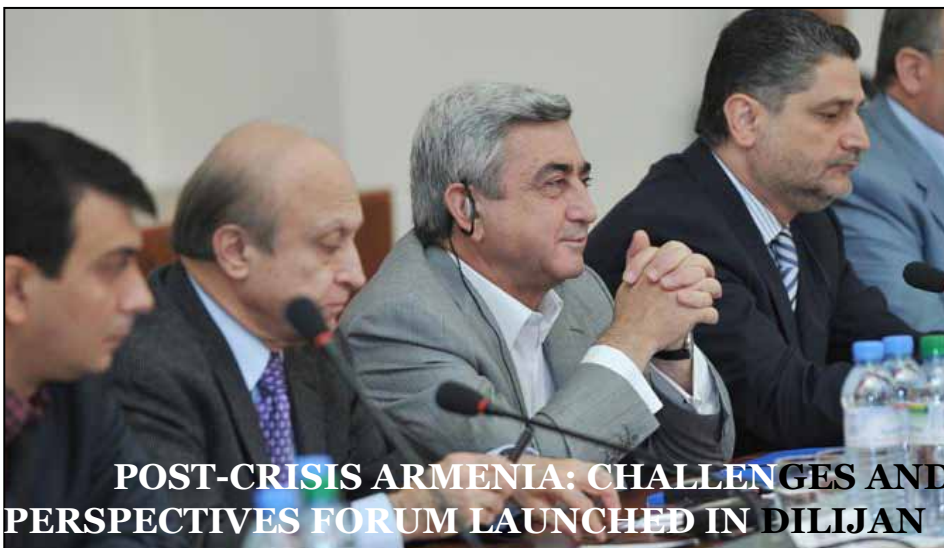
POST-CRISIS ARMENIA: CHALLENGES AND PERSPECTIVES FORUM LAUNCHED IN DILIJAN

P ost-crisis Armenia: Challenges and Perspectives 2-day forum was launched in Dilijan on September 11, 2010. The forum will focus around 3 aspects: innovation, export orientation, formation of coalition to trigger changes. Discussion on simulation of investments, economy growth and poverty reduction is also included in the agenda. The event is organized by the Armenian government with the assistance of World Bank. A delegation of high ranking Armenian officials, headed by Prime Minister Tigran Sargsyan, as well as a WB delegation, led by Vice President for Europe and Central Asia Region Philippe Le Houerou are invited to participate along with world-class specialists and professors of economics. Armenian President Serzh Sargsyan is also expected to attend some discussions. Armenian President Serzh Sargsyan met with WB Vice President for Europe and Central Asia Region Philippe Le Houerou in Dilijan resort (Tavush region, Armenia), which hosted Post-Crisis Armenia: Challenges and Perspectives international forum on September 11-12. Wide range of issues concerning further co-