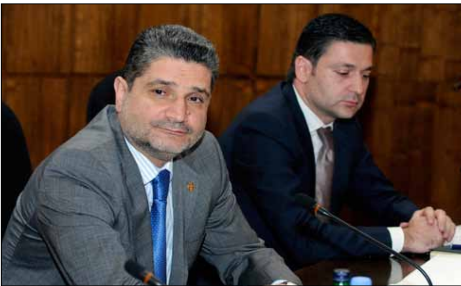
RA PRIME MINISTER MEETS WITH REPRESENTATIVES OF "YOUTH AGAINST CORRUPTION" PROGRAM

Armenian Prime Minister Tigran Sargsyan met on July 28 with the representatives of "Future is yours" NGO and of "Youth against Corruption" program implemented by the latter. The goal of the program is formation of intolerant attitude against corruption and civil activeness among young people. Five-day classes have been conducted for 300 young people of 6 Yerevan higher educational establishments by the specialists of "Future is yours" NGO, during which the participants of the program gained knowledge about the phenomenon of corruption, its manifestations, causes and consequences, about fighting against corruption and preventive measures. Discussions, disputes and quizzes were organized during the classes. During the meeting with the Prime Minister the participants of the program had an opportunity to address the questions they are interested in, to present the flaws in higher and post-graduate edu-