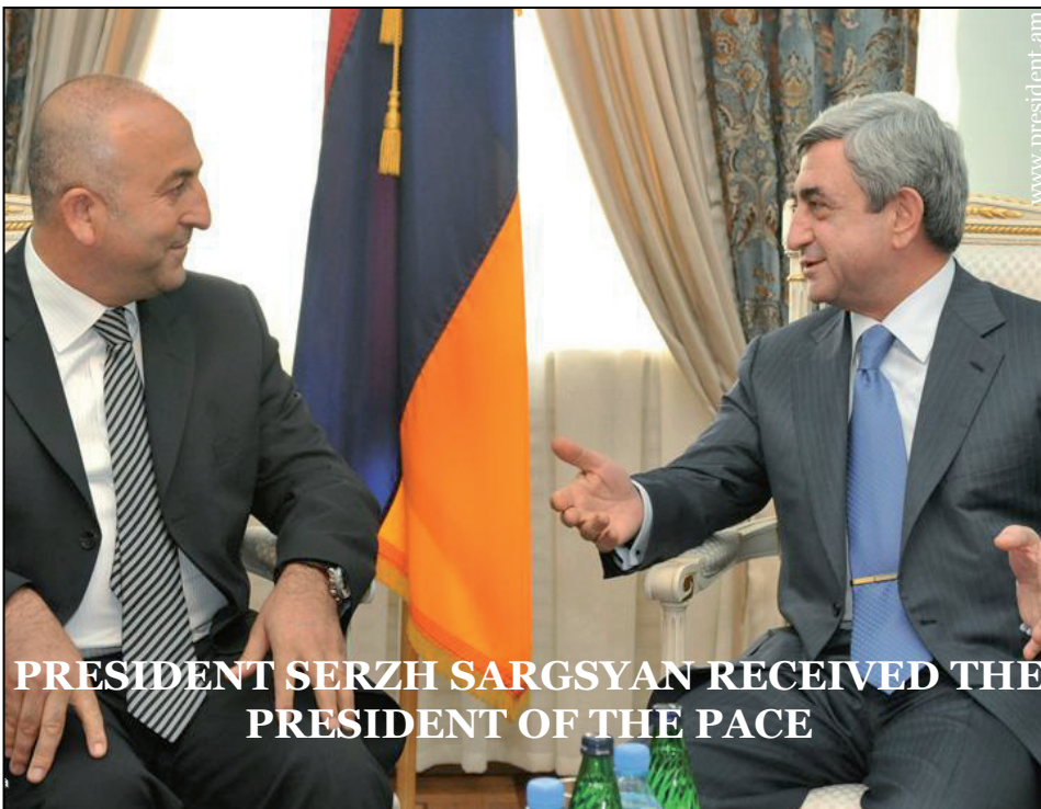
PRESIDENT SERZH SARGSYAN RECEIVED THE PRESIDENT OF THE PACE

On May 12 the President of the Republic of Armenia Serzh Sargsyan received on the President of the Parliamentary Assembly of the Council of Europe, Movlut Cavusoglu. Welcoming the guest, the President of Armenia expressed hope that the visit of the PACE delegation headed by Mr. Cavusoglu would allow to see first hand and give a more objective assessment to the challenges present in Armenia and in the region. "This visit is a good opportunity to discuss also the items on our agenda, and I am confident that it will promote a deeper cooperation between Armenia and the Council of Europe, particularly, between the National Assembly of Armenia and the PACE.